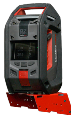
UNIVERSAL MOUNT SKU: ACC-G7EXO-UMK

Allows for mounting on pipes, scaffolding, tripods, bases and more.