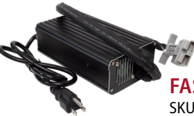
FAST BATTERY CHARGER SKU: ACC-G7EXO-FAST-CHARGER-NA