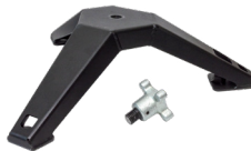
EXO BASE (STANDOFF) SKU: ACC-G7EXO-STANDOFF