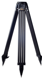
SURVEY TRIPOD SKU: ACC-G7EXO-TRIPOD