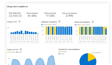
Blackline Analytics reporting platform