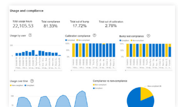
Blackline Analytics reporting platform