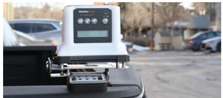
Bridge mounted to the anchor points on a truck bed rail pop-out