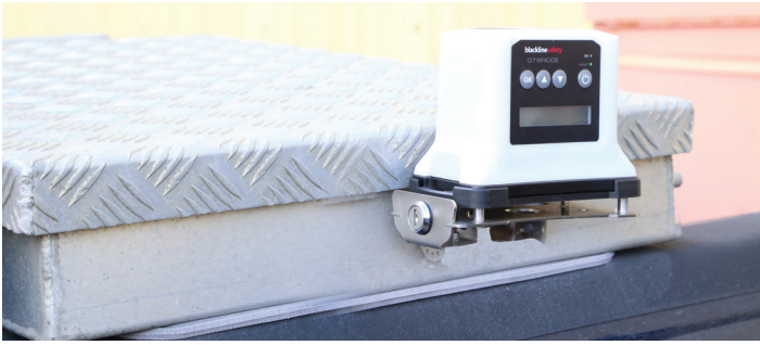
Bridge mounted to tool box using external bridge mount