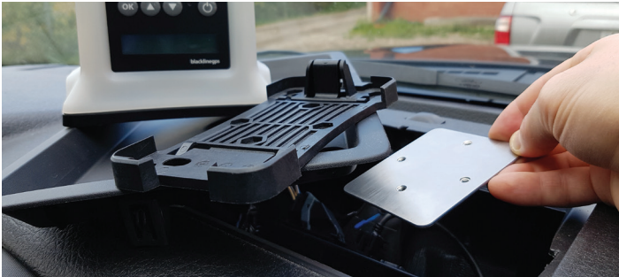
Multi-purpose clip, accessory dash plate on a F-150 dash tray and the picture of the Bridge on the dash