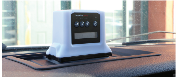
Bridge internally mounted on the dash