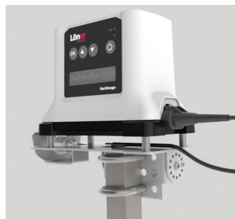
Bridge mounted to pole using external bridge mount and u-brackets