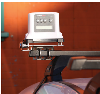
Bridge mounted to roof rack using external bridge mount and u-brackets