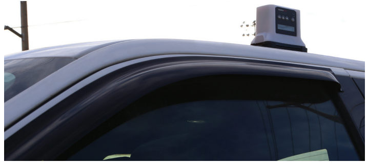
Bridge mounted to the top of a vehicle using the magnet