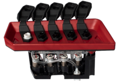
PUMP MODULE MODULE SKU: ACC-G7EXO-PUMP