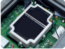
G7 EXO SATELLITE MODULE SKU: ACC-G7EXO-SAT