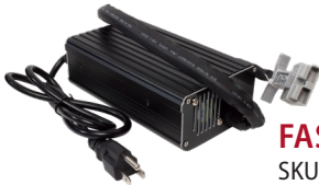
FAST BATTERY CHARGER SKU: ACC-G7EXO-FAST-CHARGER-NA